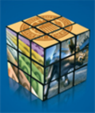
Figure 1 Structure and Responsibility for Policy Tools in the Federal Reserve System